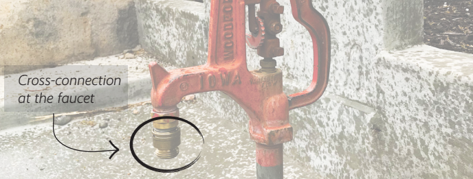
Cross-connection at the faucet